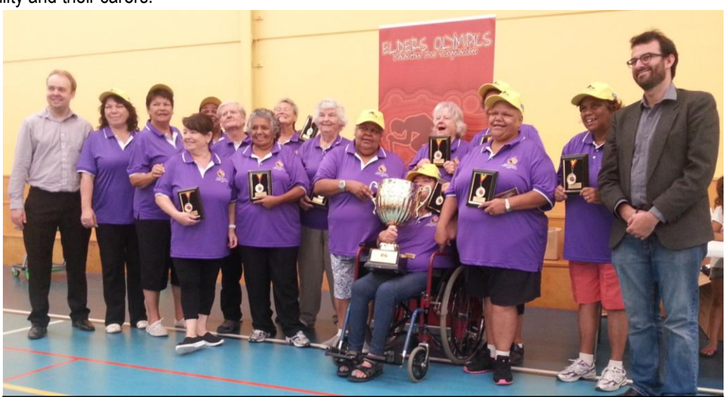
Bankstown Koori Elders Group and Hoxton Park Elders Group. Winners of the 2014 Elders Olympics held at Bringelly

of The role The HACC Aboriginal Access/Development Project Officer is to support Aboriginal frail people aged and Aboriginal people with disabilities and their carers to remain independent in the community, support HACC services. advocate on behalf of service providers. consumer groups and individuals and provide information and resources. This is done